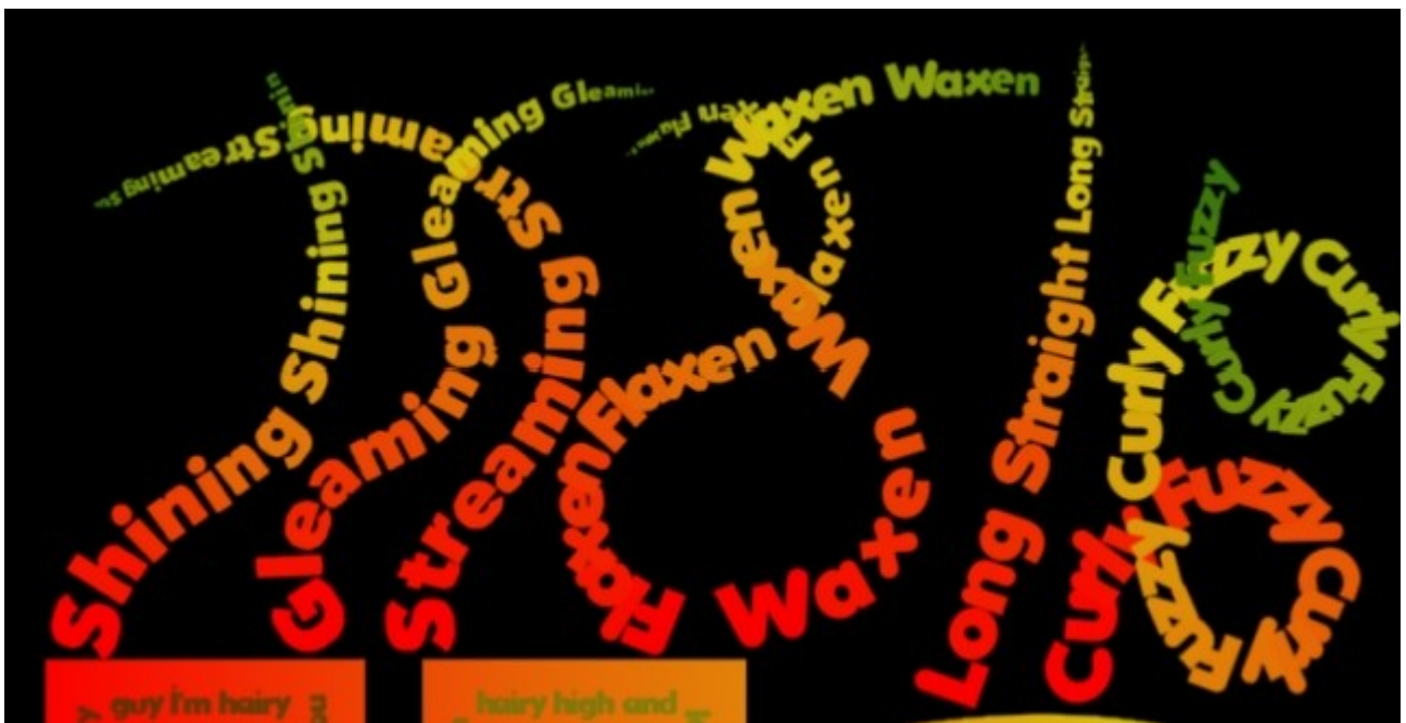
Using repeated text with Hair theme